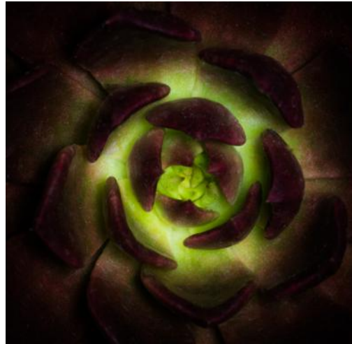
Pictured: A glowing succulent plant.

For now, the glowing succulents live safely in a lab. Scientists hope they could one day grow bigger plants, bright