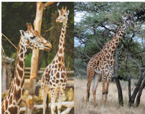
Pictured: Northern giraffes (left) and a Masai giraffe (right).