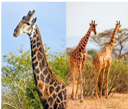
Pictured: A Southern giraffe (left) and Reticulated giraffes (right).