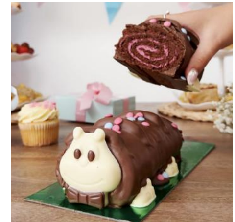
Pictured: Limited edition gender reveal Cuthbert cake!